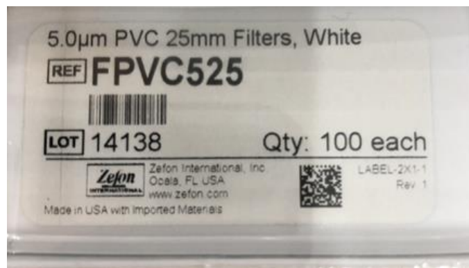
Manufacturer: Zefon, Part Number: P/N FPVC525