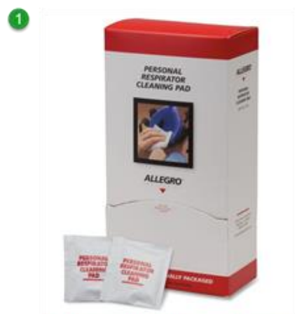
Manufacturer - Allegro Industries