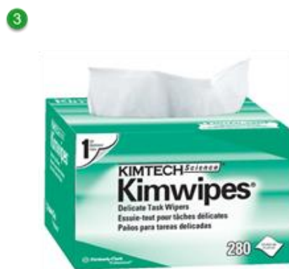
Manufacturer - Kimtech Science