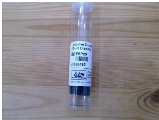
Manufacturer: Zefon, Part Number: P/N FSP25